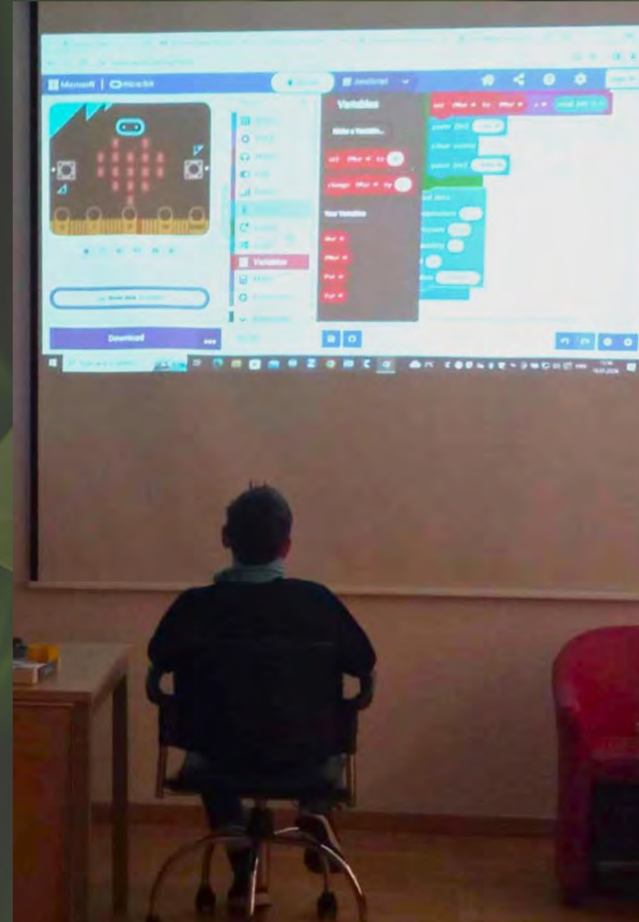
technology and AI