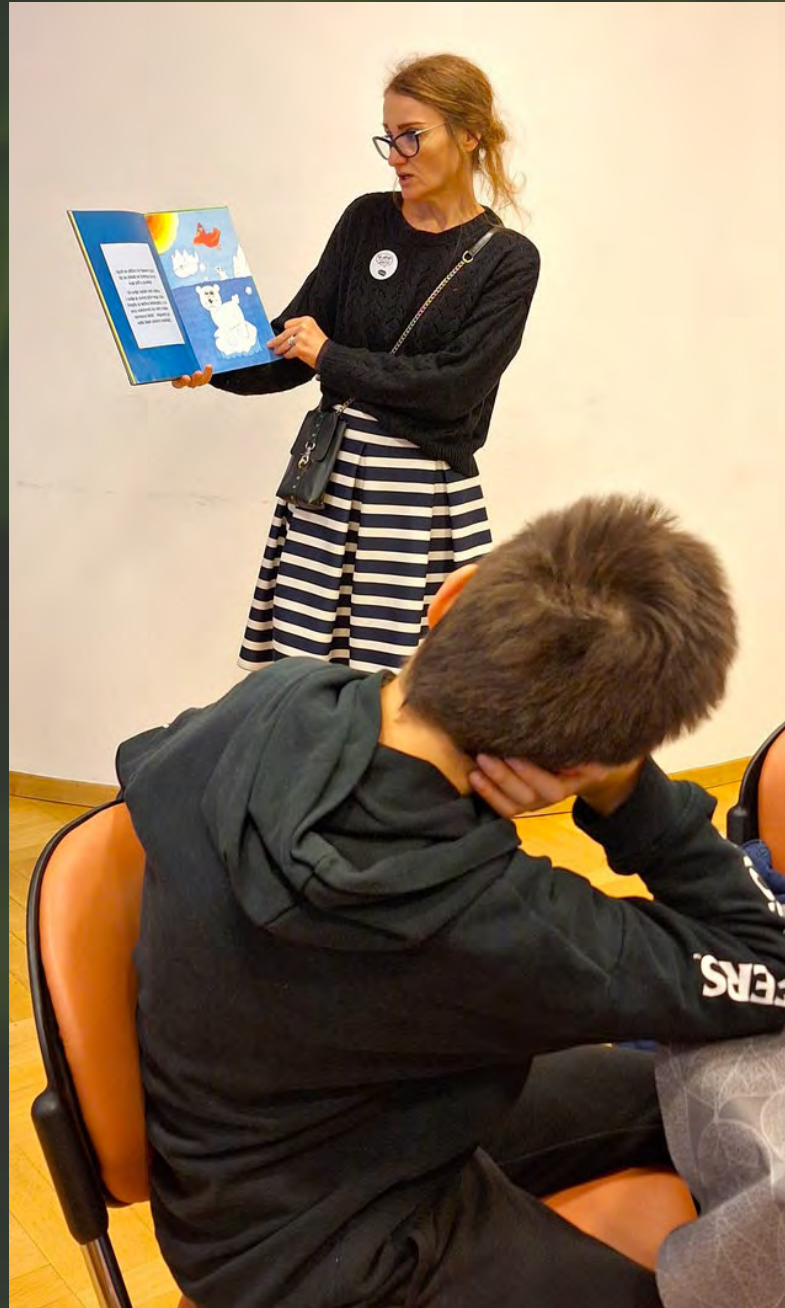
books and reading